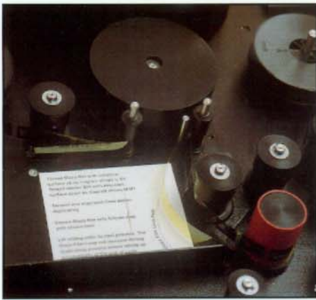
Exposure System ▲

The RB20m is ideal for medium volume users requiring a fast start diazo roll film duplicator for continuous or intermittent use. Typical production speed is 10 metres of film per minute dependant upon master film density and copy film type. No film splicing or splitting is required. Accurate speed and temperature controls enable duplication from a wide range of master film densities onto various colour diazo films with repeatable consistency of quality. Designed with the operator in mind the RB20m has many useful features.