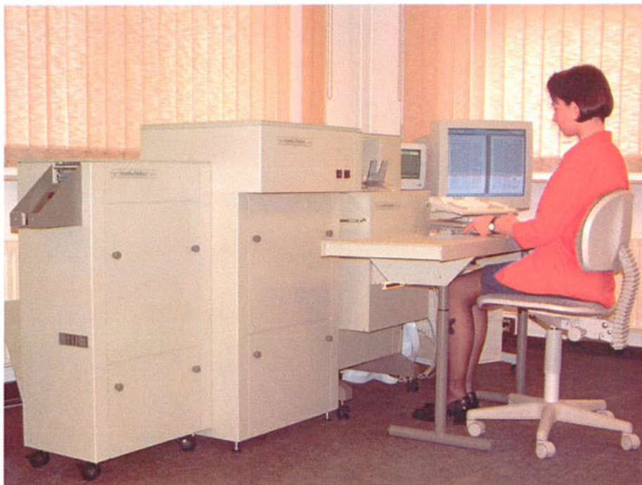
Digital and analog archiving

The scanned image can be stored on the hard disk or via network to any other digital media. The system is capable of archiving documents up to a maximum width of 305 mm and a maximum length of 3,000 mm. Document feed is either hand feed (single sheet) or fully automatic from a stack of documents. Both modes utilize the electronic double page detection feature. Apart from the standard DIN-grid formats the user can choose any grid format he desires.