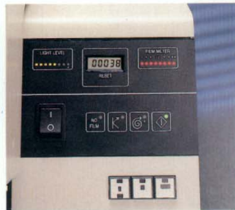
All controls and alarms are conveniently located on the front of the camera within clear view.

The endorser (dry type) stamps, dates, numbers up to 13 digits (the last 7 sequential) checks, coupons, slip-notes etc. before they are microfilmed. The endorsement can be positioned by the operator.