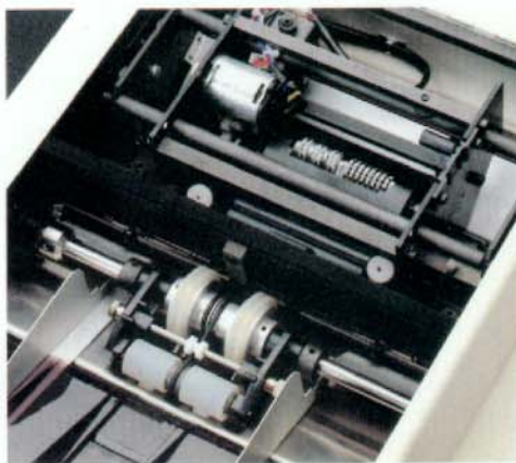
The 2402 camera with joint endfeeder allows the feeding of documents to be endorsed and microfilmed in a single passage.

The endorser (dry type) stamps, dates, numbers up to 13 digits (the last 7 sequential) checks, coupons, slip-notes etc. before they are microfilmed. The endorsement can be positioned by the operator.