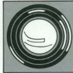
Soft rubber eye cup for more comfortable viewing.